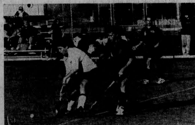
CIAU Championship Action.