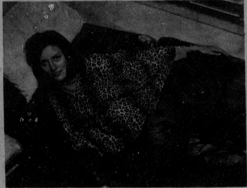
by Barb Roberts

We understand that you are, (SEE page 6, column 2)