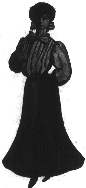
S 265—Ladies' Walking Skirts of dark mixed tweeds and plain melton cloth. Made in plain tailored styles. Sizes 37 to 44. Very special.....$1.95.

Our Ready to Wear Skirt values for April are simply astonishing. The styles are correct, the tailoring excellent and the price extremely low. Order by number giving waist measure and length required.