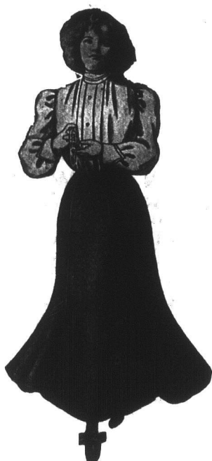
S 268—Misses Skirts, made up in melton cloth. Seven gores, nicely stitched seams. In black, navy and brown. Sizes 30 to 36. Price.....$1.50.

ORDER BY NUMBER--Mention the Western Home Monthly Address--ROBINSON & Co., Limited, Mail Order Department. Winnipeg, Man.