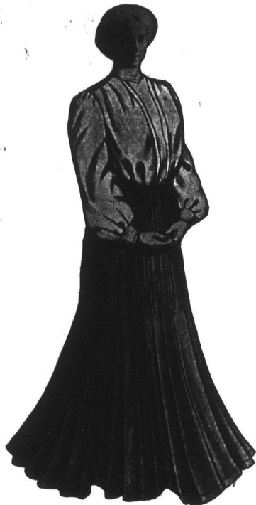
S 266—Ladies' Walking Skirts, of light grey homespuns. Made in smart pleated styles and box pleated. Sizes 37 to 42. Price.....$4.35.