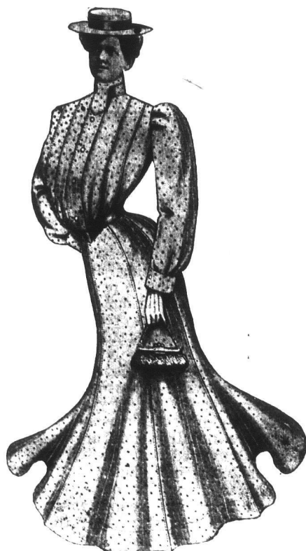
S 269—Ladies' Print Shirt Waist Suits, made with tucked blouses and full skirt with deep full. Colors light blue, navy, black and white with red spot, and green and black. Sizes 37 to 44. Price.....$1.35.

We have secured large quantities of these four specials, which accounts for the remarkable value.