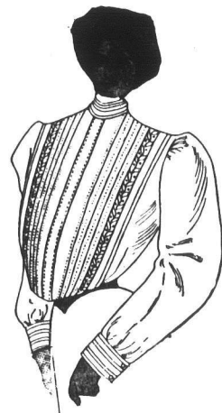
S 272—Ladies' White Lawn Blouses, trimmed with four rows emby. insertion and wide tuck, another style of fine lawn nicely tucked. Sizes 32 to 44. Price.....$1.00.