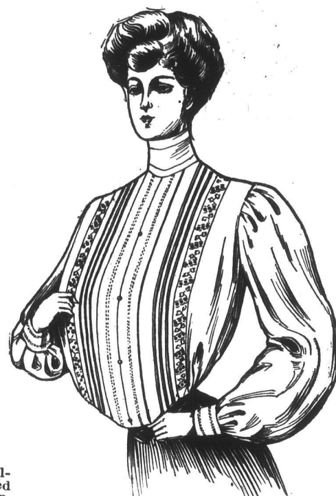
S 270—A Special Line of Ladies' Blouses, in colored print and white lawn. Hemstitched tuck and emby. insertion. Sizes 32 to 44. Price.....50c. S 271—Ladies' Black Sateen Blouses, wide tuck front and box pleat. Sizes 32 to 44. Extra value.....59c.