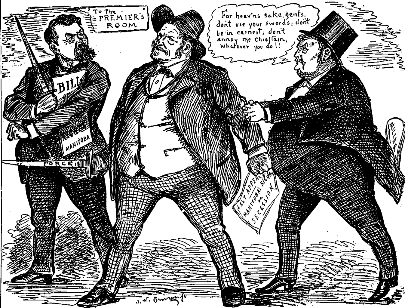
AT THE FEDERAL DOOR.