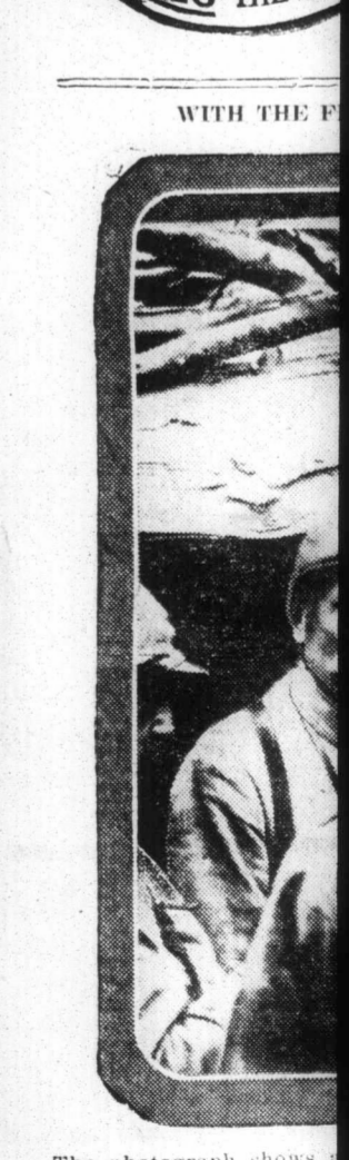
The photograph shows