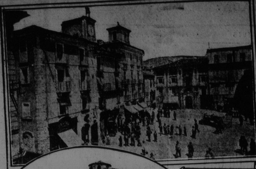
PIAZZA VITTORIO EMANUELE III