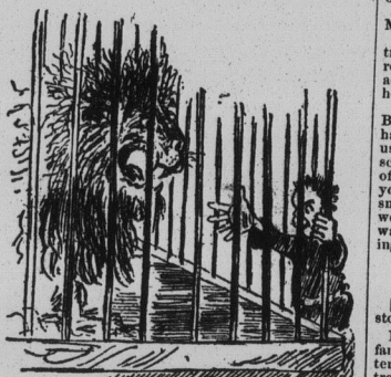
DON'T TEASE HIM

our stock when wanting anything in our line. You will find us "straight up and down" about the quality and merits of our stock.