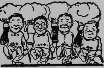
THE SEVEN A.M. PARADE A happy company that salutes each smiling morn'g, tinkle by tinkle and some through still wearing the smile. For there's no more—no "rubbing in" with Mennen's. Just a pleasant, speedy shave.