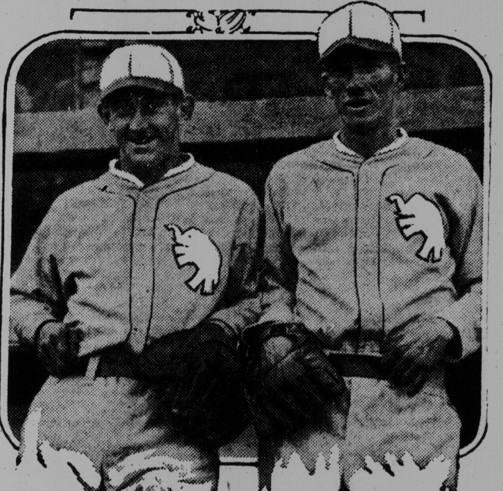
GORDON COCHRANE, LEFT, AND "LEFTY" GROVES. Presenting Connie Mack's so-called "Million Dollar Battery." In other words, Mack's catcher, and "Lefty" Groves, pitcher. The crazy Connie did pay quite that sum for them, of course. But they were expensive enough, anyway. Mack expects great things of them this season.

Work on the erection of the extended grandstand for the North End is practically finished and, if needed, would be ready for use next week. A gang of men has been at work during the last few weeks in getting the grounds into shape for the opening day on May 25 and early next week the city roller will be sent over the entire section. The area now finished and ready for playing extends 350 feet from the home plate, which gives the North End grounds one of the longest fields in the province. In addition, a small hillside that has given trouble in the past has been entirely removed by dynamiting and teams will find this a big advantage. The completed grandstand will have a seating capacity of about 650.