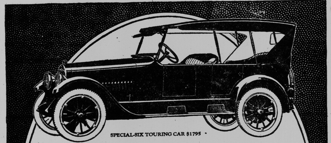
SPECIAL-SIX TOURING CAR $1795