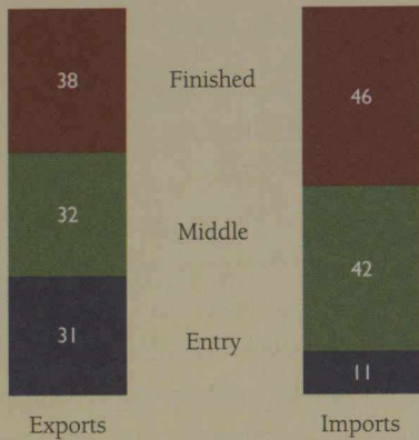
Stage of Canadian Trade from the Importer's Perspective* (per cent)