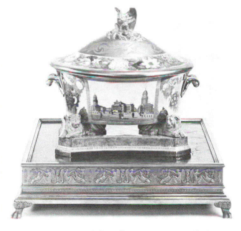
This tureen of hard-paste porcelain, with its stand of ormulu and leather, made about 1823 in Berlin, was part of a large dinner service of more than 350 pieces. Each of the serving pieces, including three surviving tureens is decorated with views of Berlin and bands of mixed flowers.

Tureen with stand, tin-enameled earthenware (faïence), Denmark, Holstein, Kiel, Tännich or Buchwald period, circa 1770 (left centre).