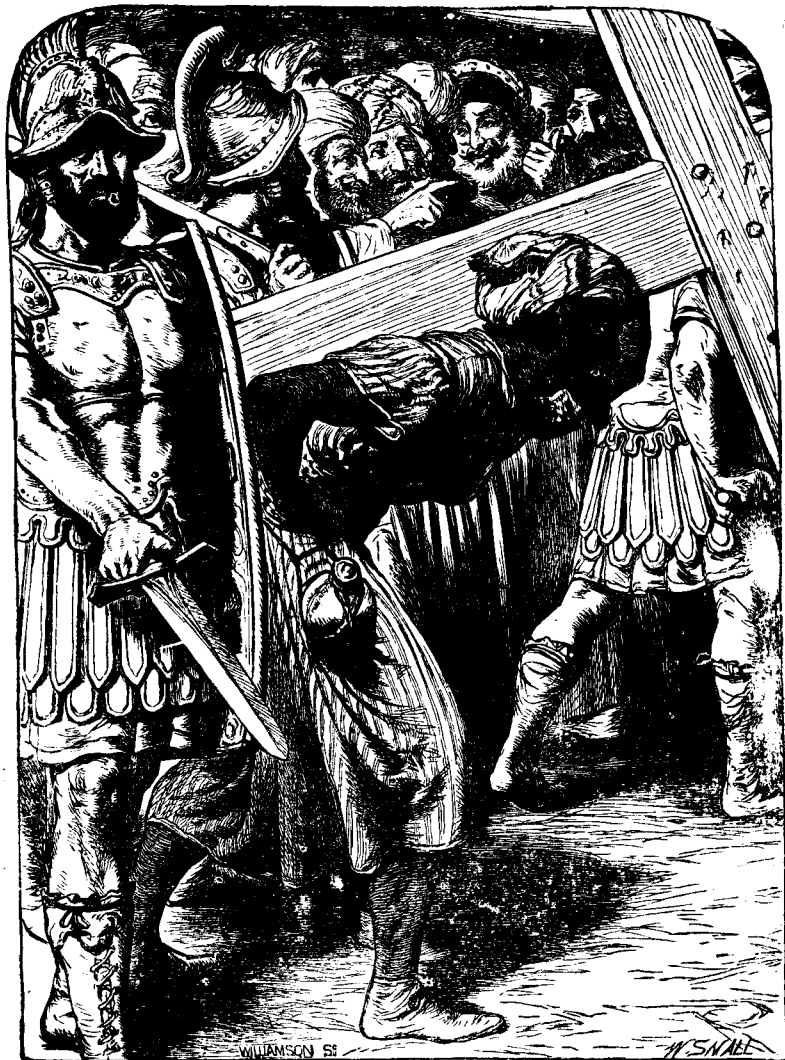
SIMON BEARING THE CROSS OF JESUS.