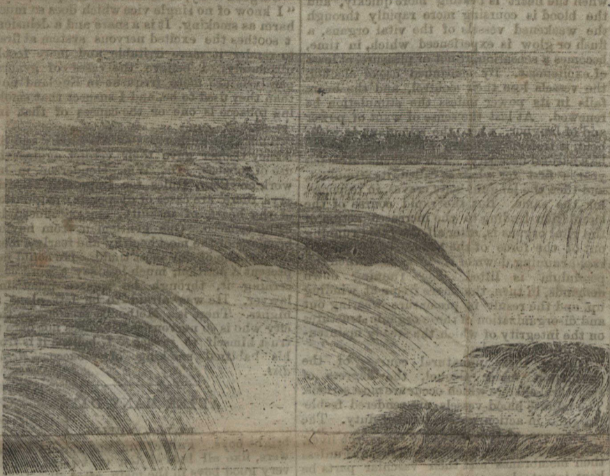
CHAUDIERE FALLS, OTTAWA (SUMMER.)

But his own pace is visibly increasing, and even his most zealous friends recognize his danger. They call to him, but he laughs at them and pushes his boat a little nearer the edge. They call louder, and he becomes angry; what must they think of him to entertain such fears? Do they mean to associate him with men of disreputable character. But faster and faster he goes. The very pace makes him giddy, and he has neither will nor ability to grasp the means of rescue thrown to his aid. His speed is terrific, and he is on the very brink of destruction. Does he see his danger and his fate? Perhaps he does, perhaps not. Now one shrill scream pierces the air, and he is lost. But his despairing wail does not appear to reach beyond the narrow circle of those giddy ones who immediately follow, and those far out on the smoother water are too much engaged with their own affairs to notice his descent. Thus day by day, year by year, perish many of the best and noblest of our land, who tempted by the outward attractions of sin pause not till drawn to eternal ruin.