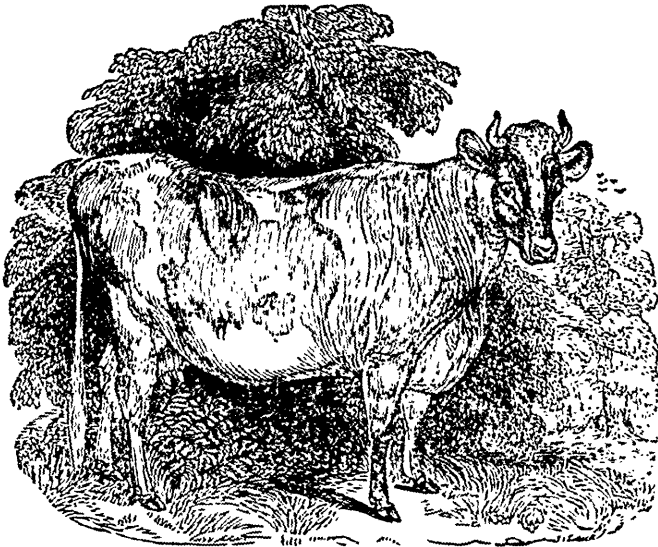
THE ALDERNEY COW.

One excellence it must be acknowledged that the Alderneys possess; when they are dried, they fatten with a rapidity that would be scarcely thought possible from their gaunt appearance, and their want of almost every grazing point, while living.