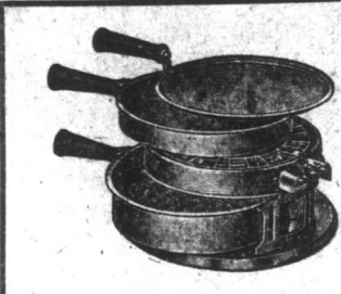
Electric Grill Cooks without smoke