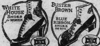
WHITE HOUSE SHOES FOR WOMEN