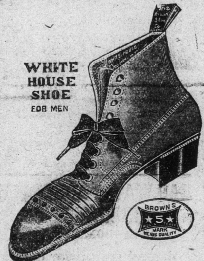
WHITE HOUSE SHOE FOR MEN