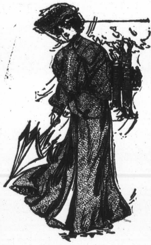
Mail Orders Filled

We are agents for the celebrated Novi-Modi Costumes