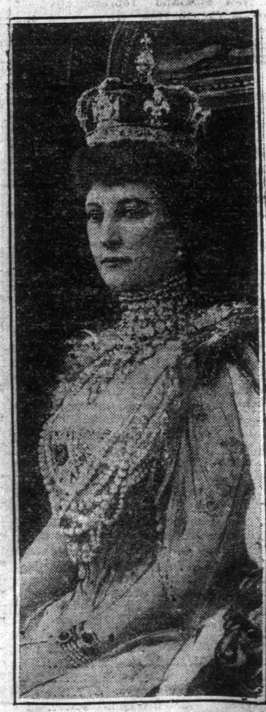
QUEEN ALEXANDRA OF ENGLAND

tion by orders of Louis XVIII., and King John of Saxony, both popularly One of the power-boats was placed in locked up as a lunatic in the asylum believed to have survived their alleged commission at the station at Stage