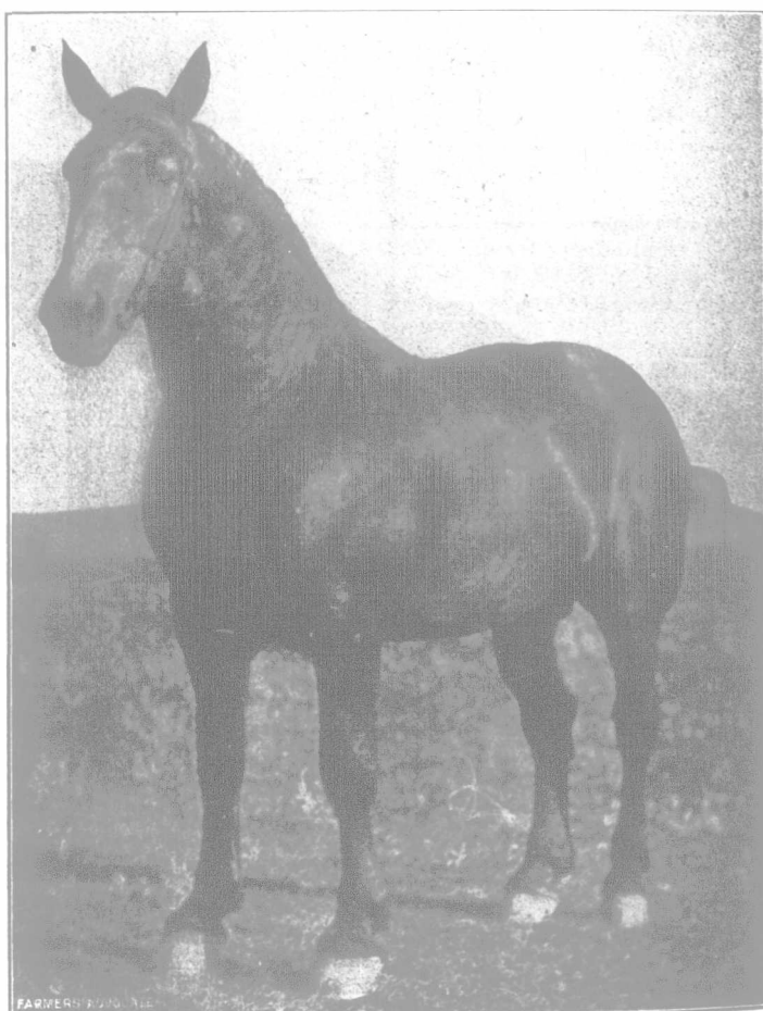
FIRST PRIZE PERCHERON MARE.

or in and maintain a uniform, or a nearly uniform, temperature. A wall such as you describe would conduct heat rapidly, the rapidity of conduction depending on the difference between outside and inside temperatures. If the outside temperature were 20 degrees below zero you would have a difference of 75 degrees to contend with, and unless your walls were extremely well insulated you could not hope to have anything like a uniform temperature inside. It would cost considerable to make the walls so they would retain the heat. They would need at least two, and, better, three air spaces, which would mean two or more ply of lumber and building paper on the inside, each ply separated from the other by strips, giving an inch space between. The ceiling and floor also would have to be so constructed, and the doors protected in some way to prevent loss of heat. Even then you would find the temperature would vary a good deal above or below the point desired, for in no manner of heating yet devised is it possible to supply heat so uniformly that there is no variation in the quantity received, or so that the amount received corresponds at all times with the amount lost. The heating apparatus