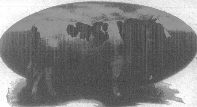
KING SEGIS PONTIAC POSCH—Senior Sire in Service at Manor Farm. Sire—King Segis Pontiac Alcartra (the $50,000 sire). Dam—Fairmont Netherland Posch, 32.59 lbs., 4 years old.

DEPT. S. THE WILLIAM WELD CO., LTD., LONDON, ONT.