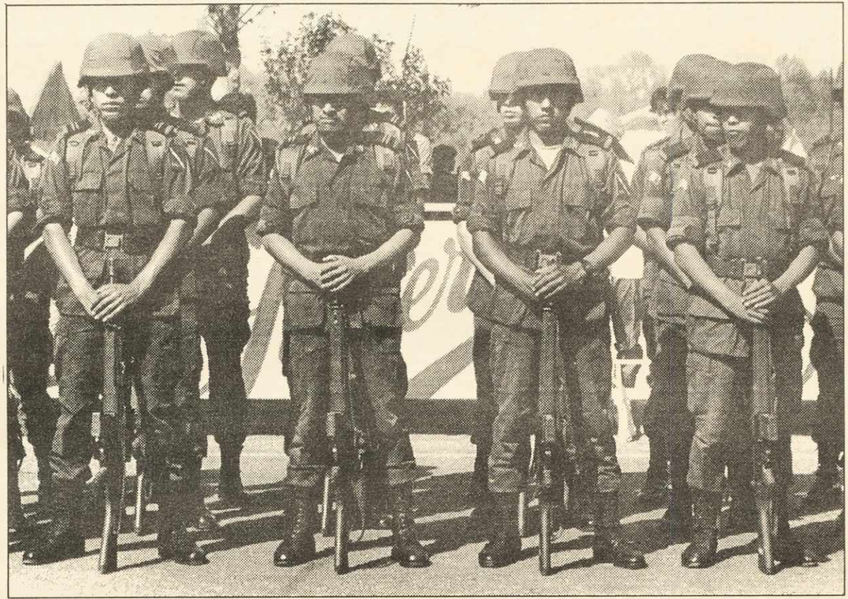
In a nation of extreme social injustices, the role of the army is a dubious one.

The student movement of 1968, which began in July and ended with the massacre on October 2, was focused against the mechanism of repression used by those in power, while expressing anger over the painful hypocrisies in Mexican politics. The Olympics were staged to eagerly prove to the world that Mexico was a nation high on Olympic ideals – those of progress, democracy, and modernity. But just as the movement was an outcry to condemn the powers-that-be, so too was its aftermath –the massacre– a firm abrogation of those very ideals.