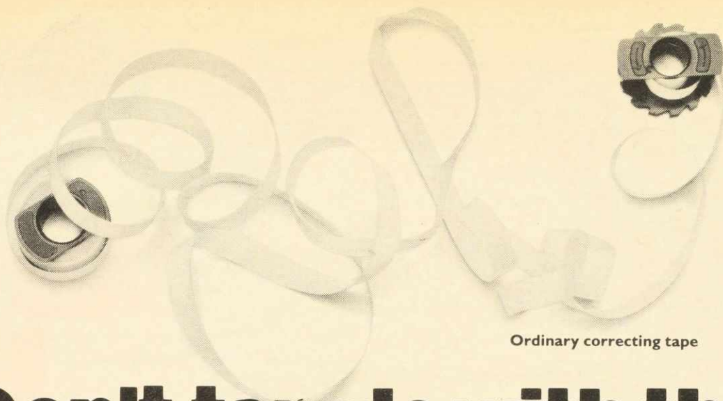
Ordinary correcting tape