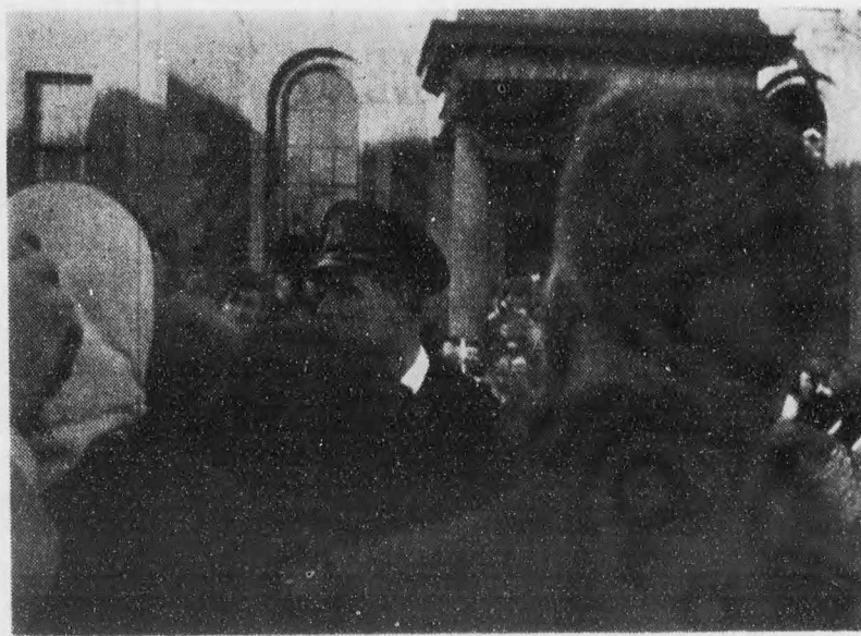
The Duke of Edinburgh shown surrounded by co-eds to the disadvantage of our photographer.