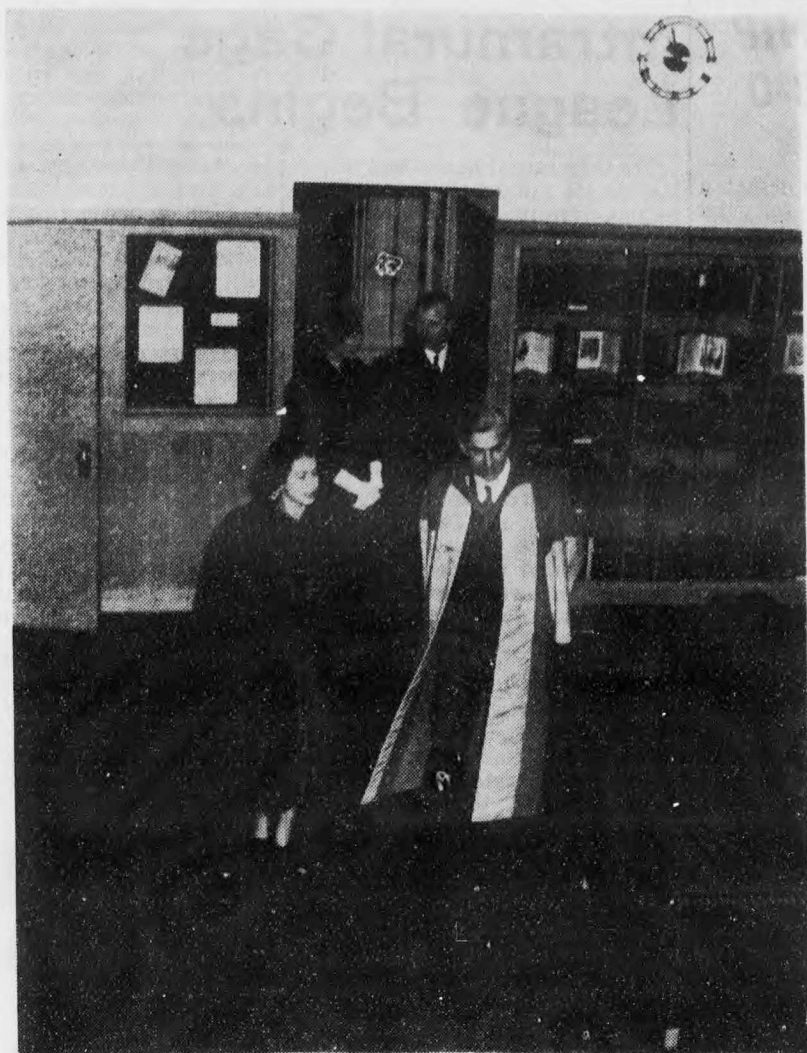
Upon leaving the Library the Princess and Prince stop to talk with two UNB students.