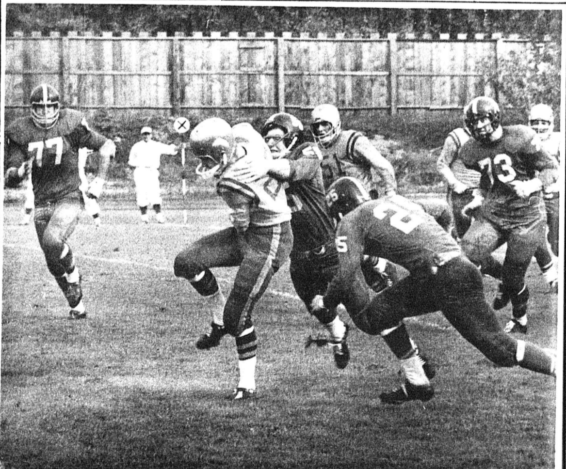
FIRST DOWN IN SIGHT —Bears startled UBC faithful Saturday by handing the Thunderbirds a 44-33 trouncing. One hundred and twenty Bear boosters cheered the Golden Ones to victory at the Vancouver stadium.