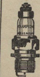
Heavy Duty Medium Powered Cars. $1.00

Champion Spark Plug Co. of Canada, Limited, Windsor, Ont.