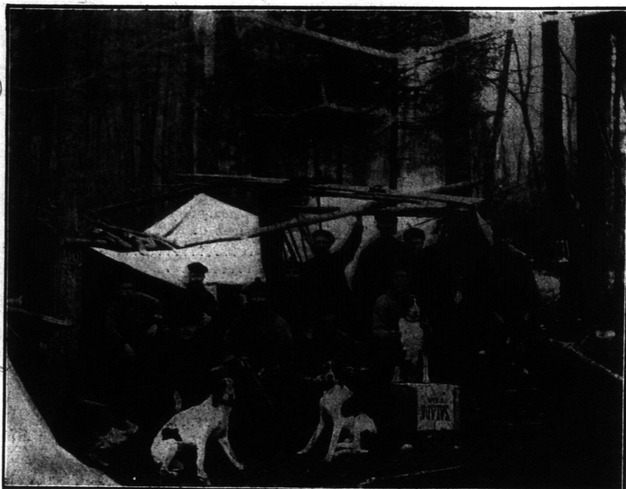
Anticipating Good Sport.

At a recent examination for girls this composition was handed in by a girl of twelve: "The boy is not an animal, yet