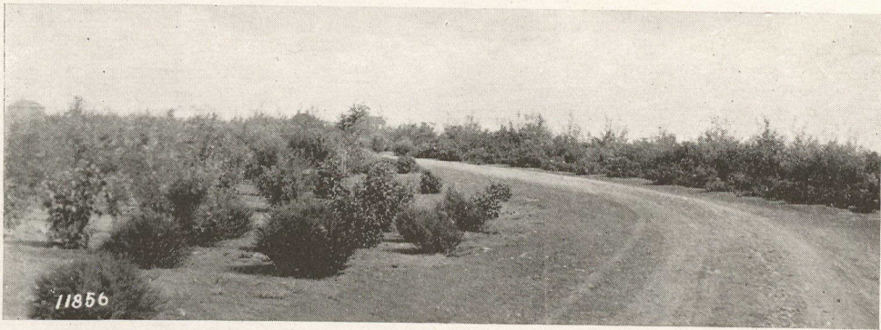
Building up a new forest nursery, under the Dominion Forestry Branch, at Sutherland, near Saskatoon.