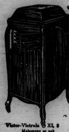
Victor-Victrola 3 XI, 8 Mahogany or oak

The Mann cup was put up by Sir Donald D. Mann and represents the Dominion lacrosse championship, the champion team of any recognized district being eligible to challenge the holders of the trophy. The donor intended this cup to help develop the playing of good clean amateur lacrosse all over this fair Dominion and the V. A. C. made two trips to Toronto before winning out from the Young Torontos, at that time holders of the cup.