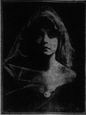
Miss Lillian Gish, as "Elsie," daughter of the Hon. Austin Stoneman, in "The Birth of a Nation."