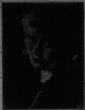
Miss Mae Marsh as "Flora," the Sister of Col. Ben. Cameron, in "The Birth of a Nation."