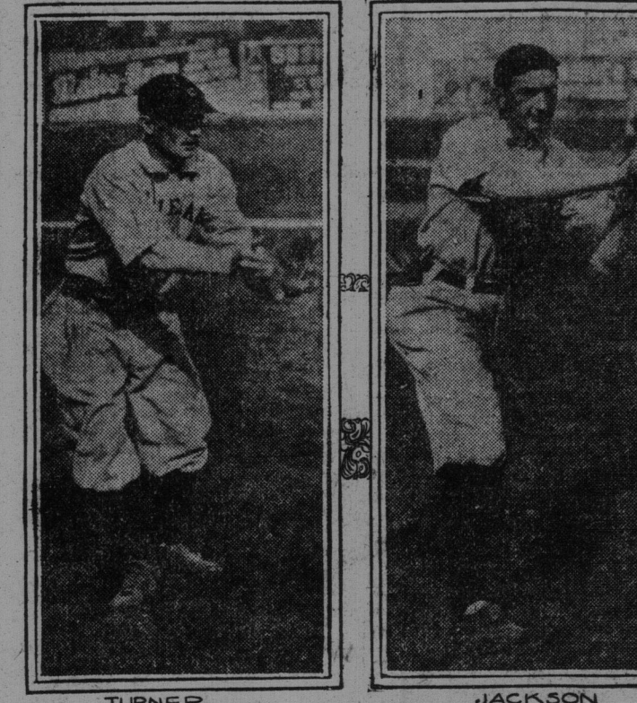
JACKSON CLEVELAND SLUGGER.