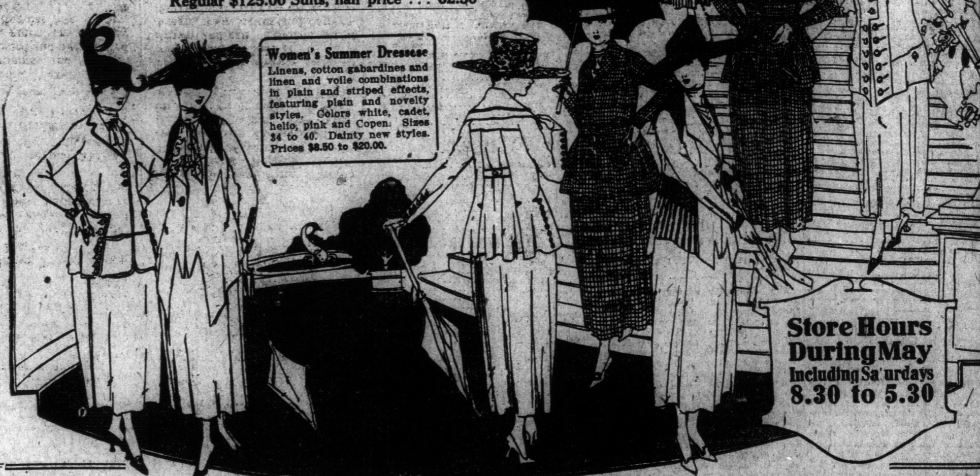
Women's Summer Dresses Linen, cotton gabardines and linen and voile combinations in plain and striped effects, featuring plain and novelty styles. Colors white, cadet, helio, pink and Copen. Sizes 34 to 46. Dainty new styles. Prices $8.50 to $20.00.

Girls' Tub Dresses 49c No Phone or C. O. D. Orders 500 Girls' Gingham Dresses, in striped and plain effects, in good washable patterns; all made in good style, and are ideal dresses for school wear. Sizes 6 to 14 years. Today, each . . . . . 49c