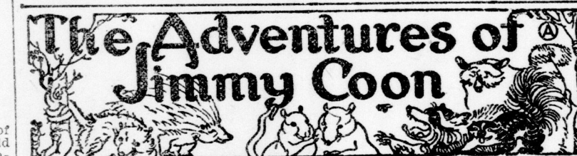
TEDDY POSSUM SAVES JIMMY'S LIFE.

Copyright, 1919, by Newspaper Feature Service, Inc. Great Britain rights reserved.