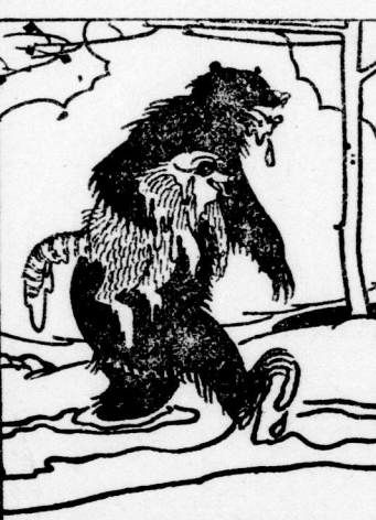
He waded into that mud and pulled poor Jimmy Coon loose, and carried him under one arm to the bank.

he stepped boldly out. Deeper and deeper he sank. He cried for help. Cousin Bruin thought it a huge joke, and he rolled on the ground with laughter, but Teddy Possum was scared. He thought it was the last of poor Jimmy, and he knew Father Coon would make it hot for him if Jimmy never turned up. So Teddy held on to a log on the shore and he pulled his long tail, like a rope, until it reached Jimmy. Jimmy was too worn out to catch hold of it, but he pulled it up to him. Finally Jimmy gave a huge sigh of despair. He walked right down into that mud. At first his little feet made little tracks and didn't sink in, but at last, urged on by those nescals on the bank,