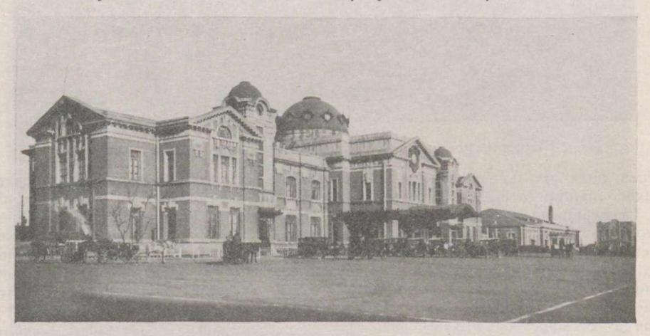
Fig. 21 is the railway station at Mukden