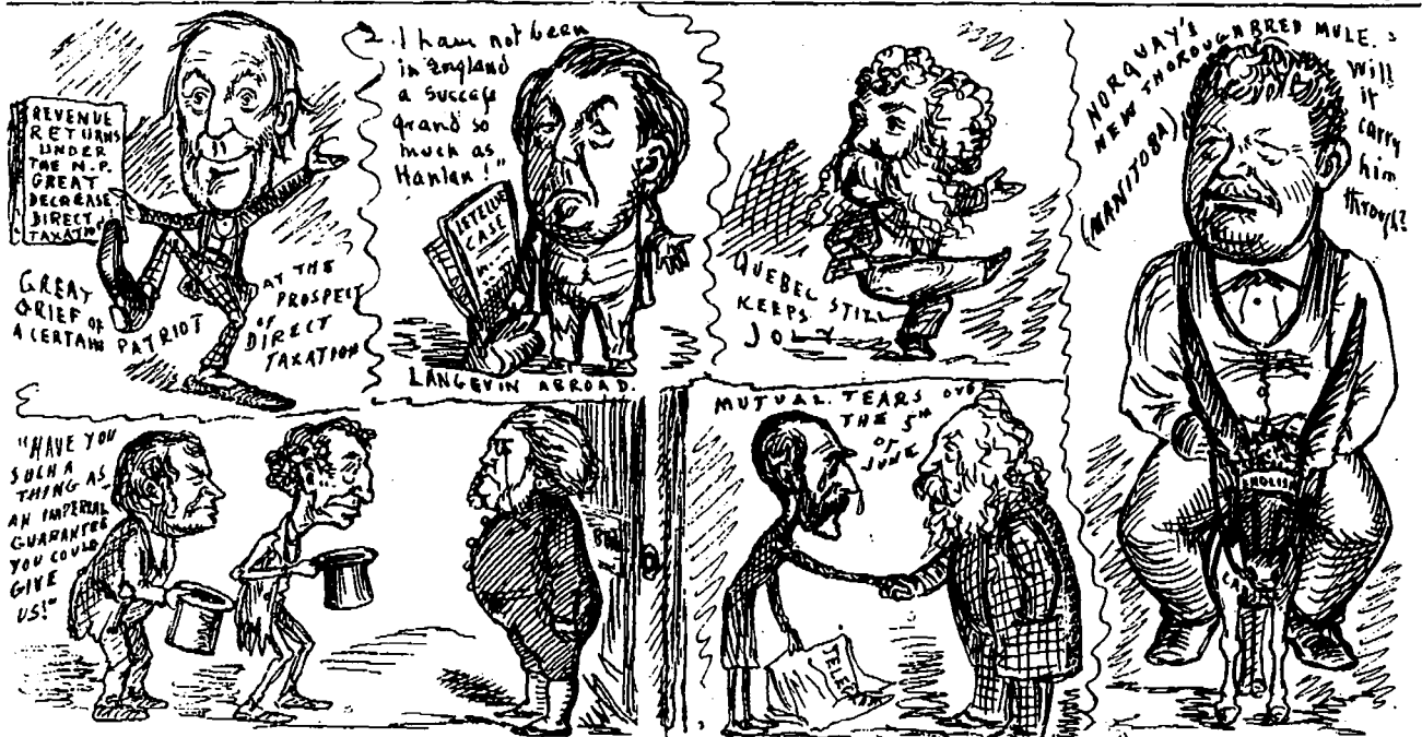
POLITICAL NOTES OF THE DAY.