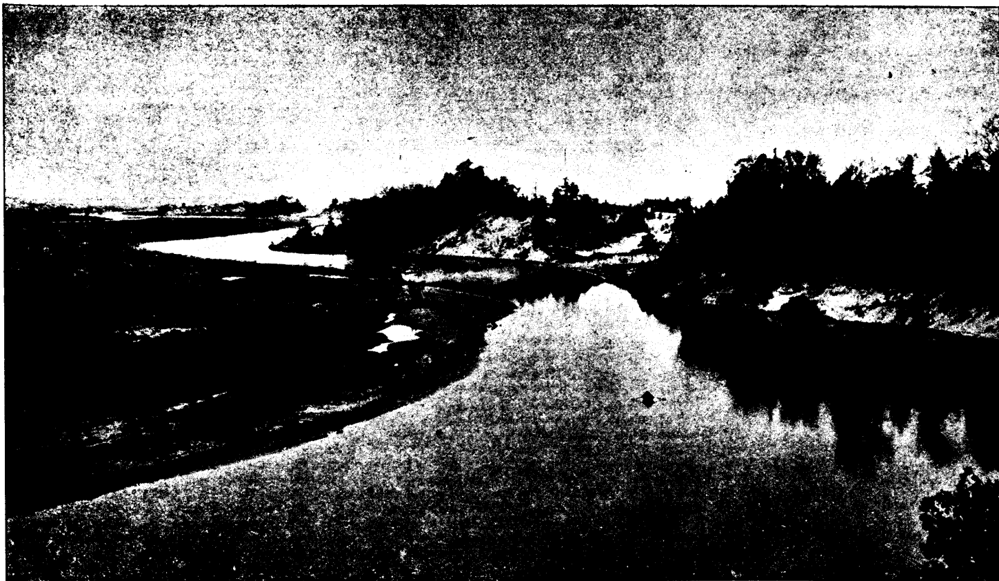
VIEW ON AUX-SABLES RIVER, PORT FRANK, ONT.