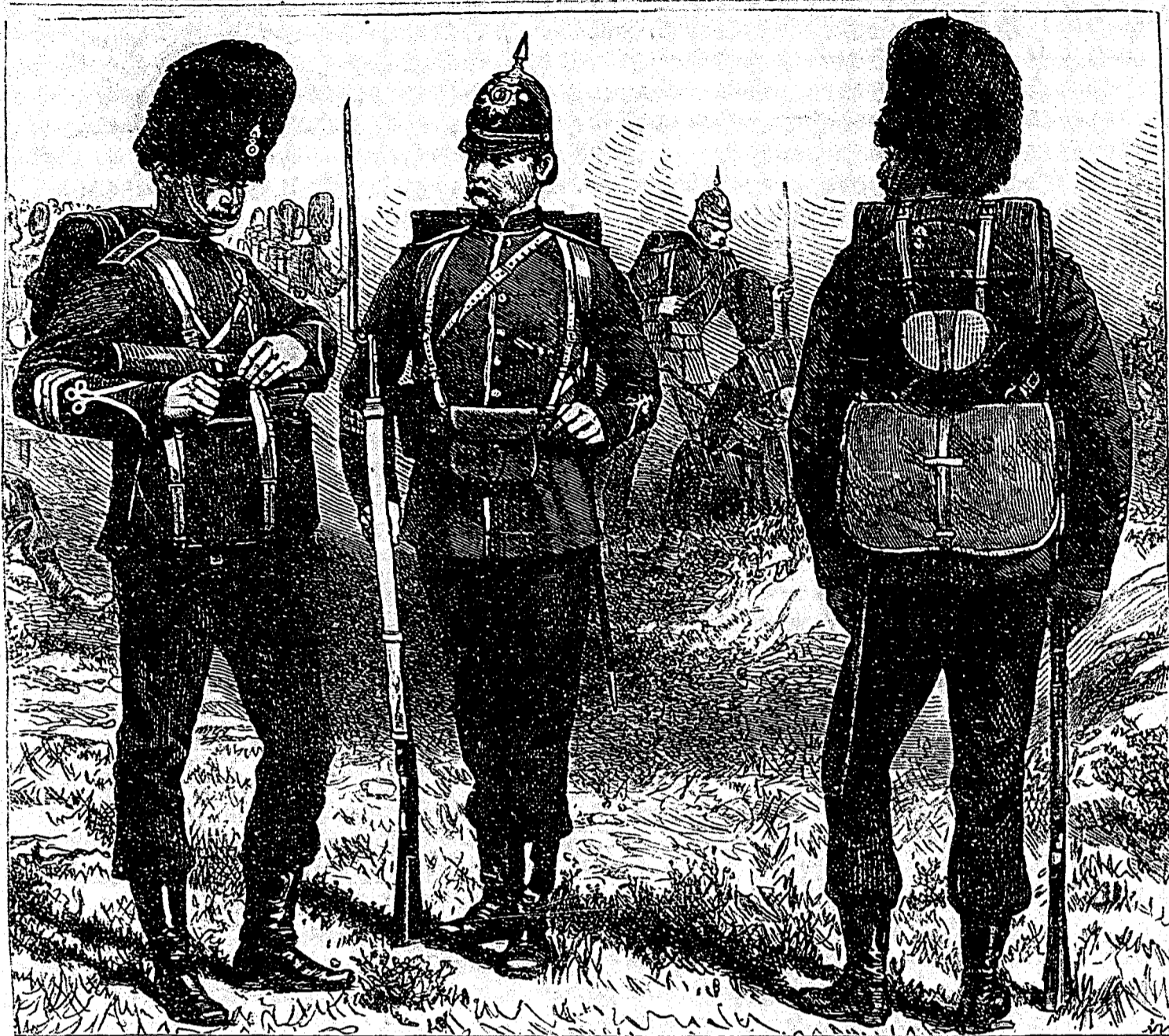
THE OLIVER ACCOUTREMENT. SEE PAGE 286.

WILLIAM DOW & CO. BREWERS and MALTSTERS MONTREAL.