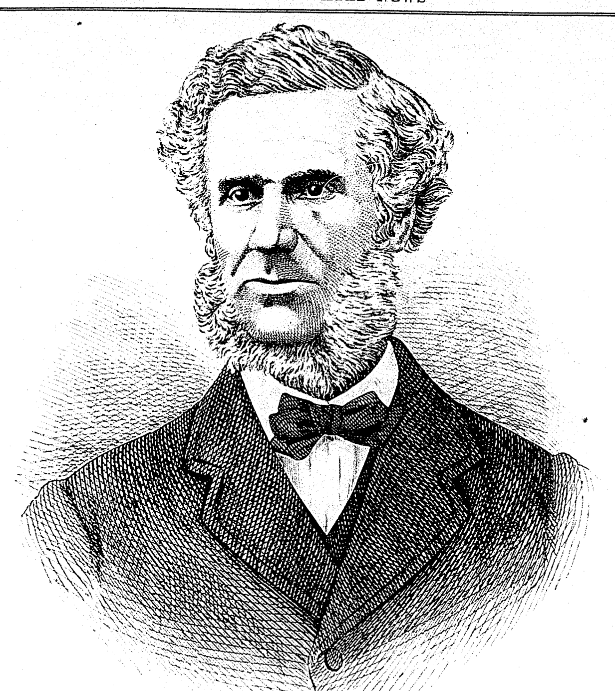
THE HON. ALEXANDER VIDAL, RECENTLY APPOINTED TO THE SENATE.