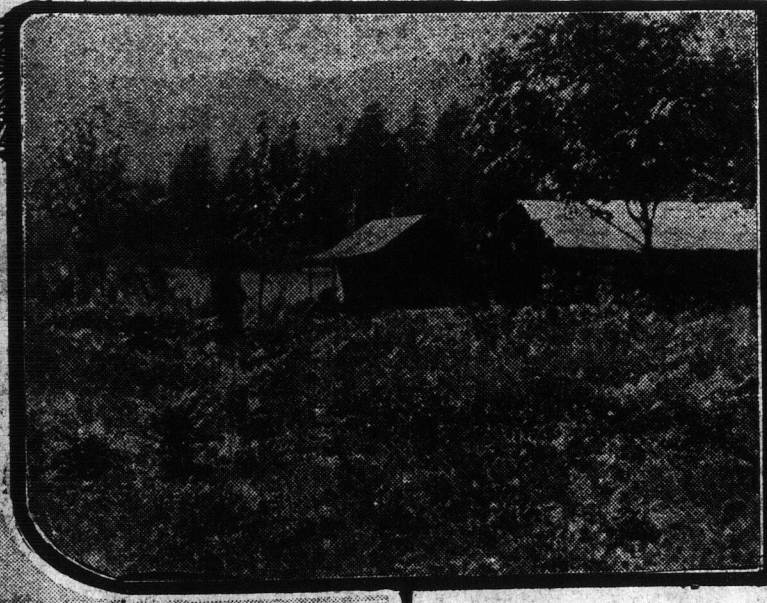
THE MAPLES SOOKE LAKE