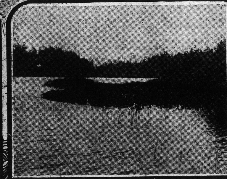
THE LOWER NARROWS SOOKE LAKE

the last twenty-four hours, and N. and myself had every reason to expect that a large number of sea trout had found their way into the loch with the increased flow of water. Whether such was the case we were unable to discover, but they certainly gave no signs of their presence.