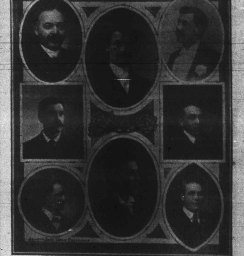
MEMBERS A. B. MINSTRELS.

Enjoy yourselves. Have the big laugh, 75 black face artists. (leneral admission $1.00