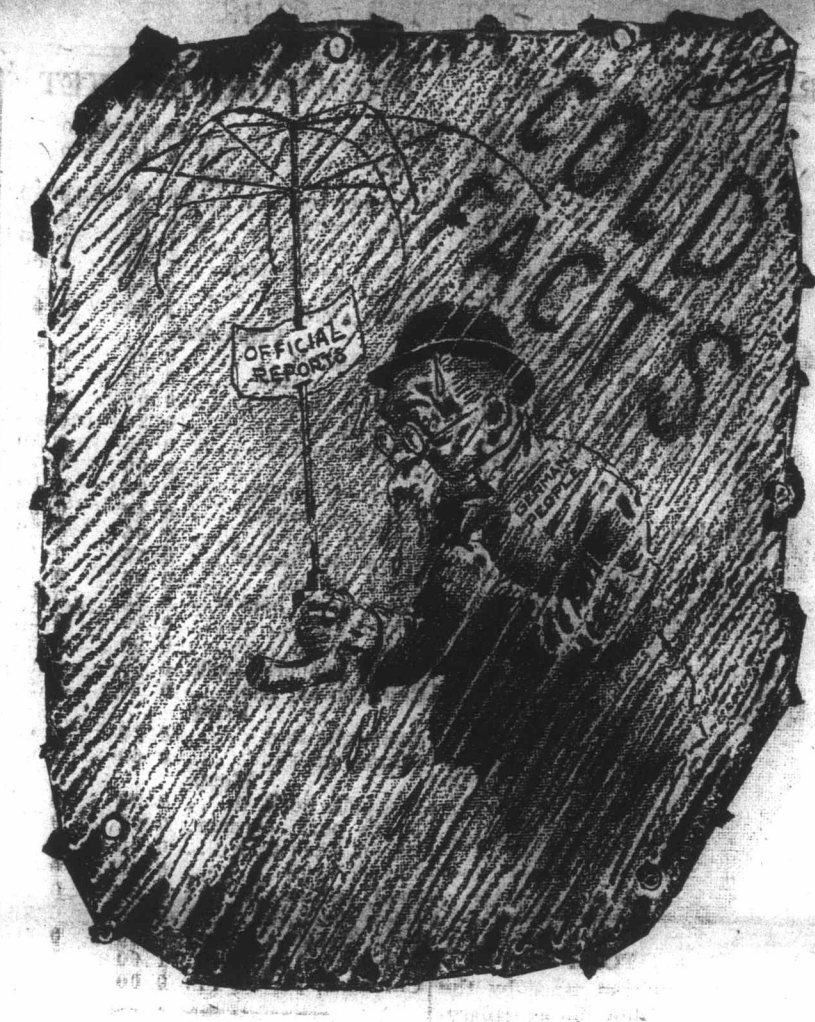
"GRADUALLY SOAKING IN." —Philadelphia Ledger.

Ottawa, Aug. 27.—At an enthusiastic meeting of the Ottawa branch of the Federated Letter Carriers of Canada, the delegate who will attend Dominion convention in Hamilton next week was instructed to vote for a general strike if the consent is obtained of the other branches of the service, namely, the railway mail clerks and the postal clerks. The cause for this drastic action is that the carriers believe that they should receive the same salary as the men employed in Western Canada.