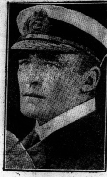
COMMANDER TYRWHITT In command of light cruisers and four destroyers which chased eleven German destroyers to the cover of batteries at Zebrugge, the foe refusing to fight.