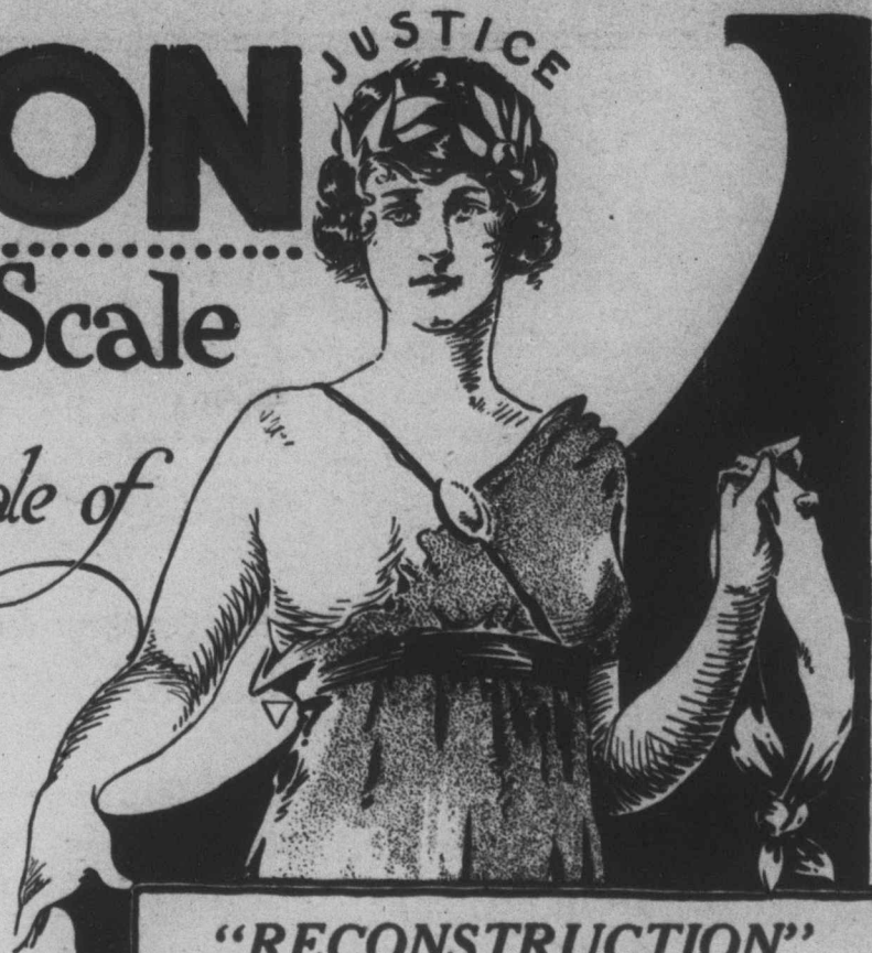
The Dayton---Made in Canada