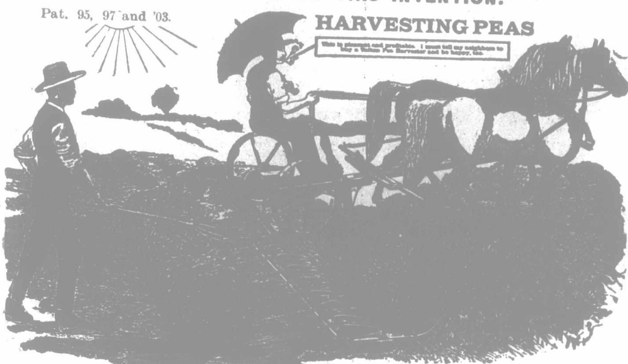
The Genuine Tolton Pea Harvester with New Patent Buncher at Work.