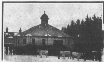
CLASS IN STOCK JUDGING, JANUARY, '09

Special Railway Rates on all railroads. Delegates should be careful to secure a STANDARD CONVENTION CERTIFICATE when purchasing their one-way ticket.