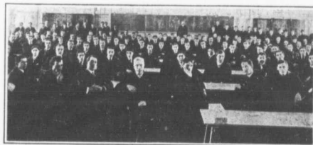
CLASS IN SEED JUDGING, JANUARY, '09

THIS COURSE IS ABSOLUTELY FREE. There are no fees and no examinations. Living expenses including railway fare (for the average student) should not exceed $12 for a period of two weeks.