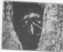
In a Hollow Tree

From the subdued expressions heard on such a scene was not uncommon in that district. Those eggs, good, bad