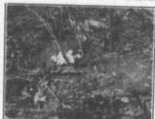
A Typical Wood Nest

How can the hens be prevented from stealing away their nests? We have noted in our experience that hens are not so apt to steal away their nests where clean darkened nests are provided in the hen house. Likewise,