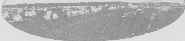
Saskatoon, 1903—a few Shacks,—113 Hopeful Souls.