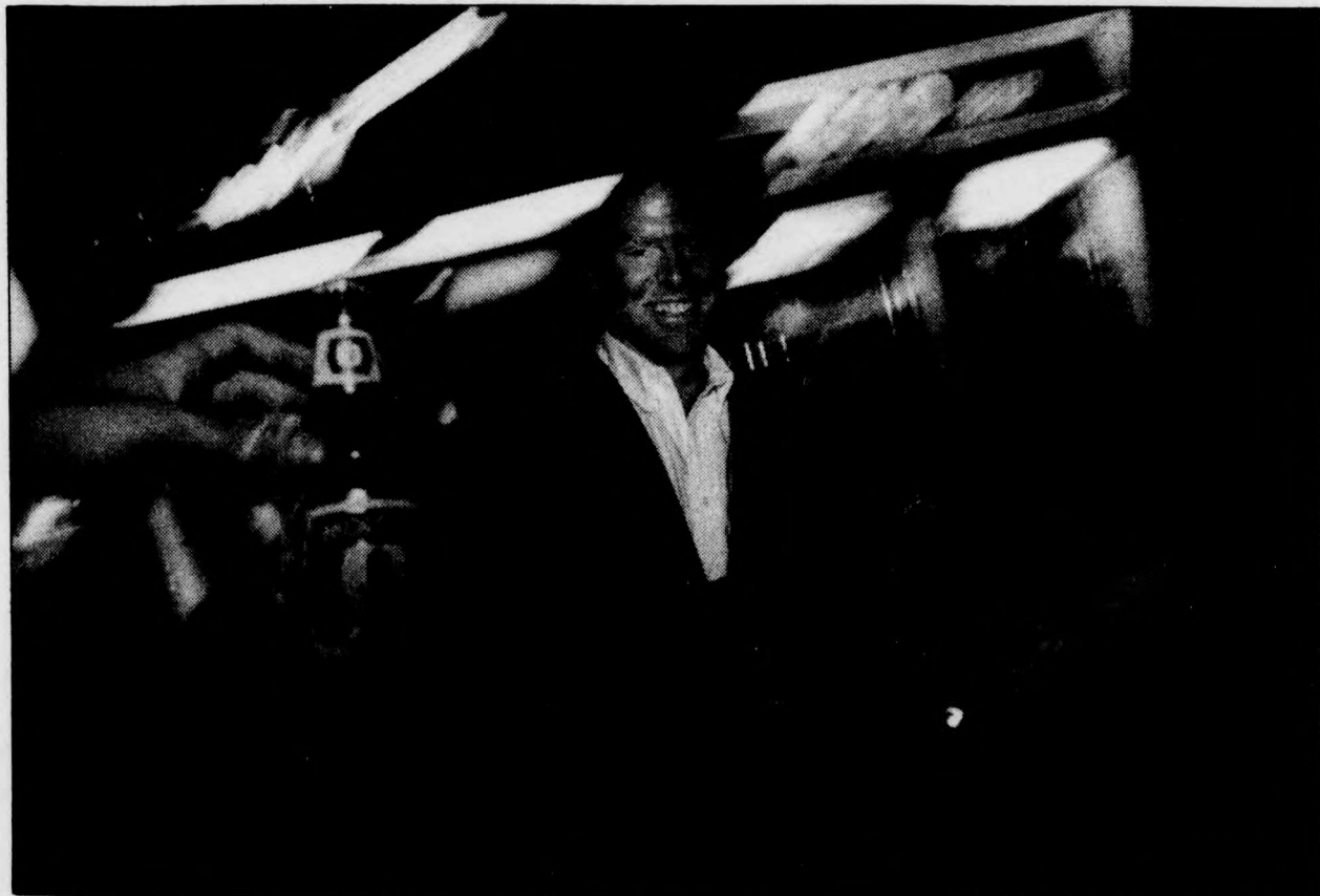
5:37 p.m. — Grabbing a cold one at the Cock and Bull