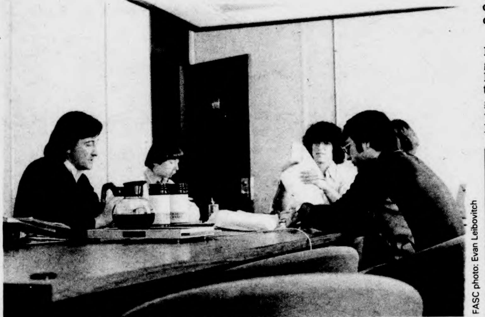
One of the F.A.S.C. committees moves into action.