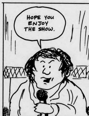
Warren Clements graphic